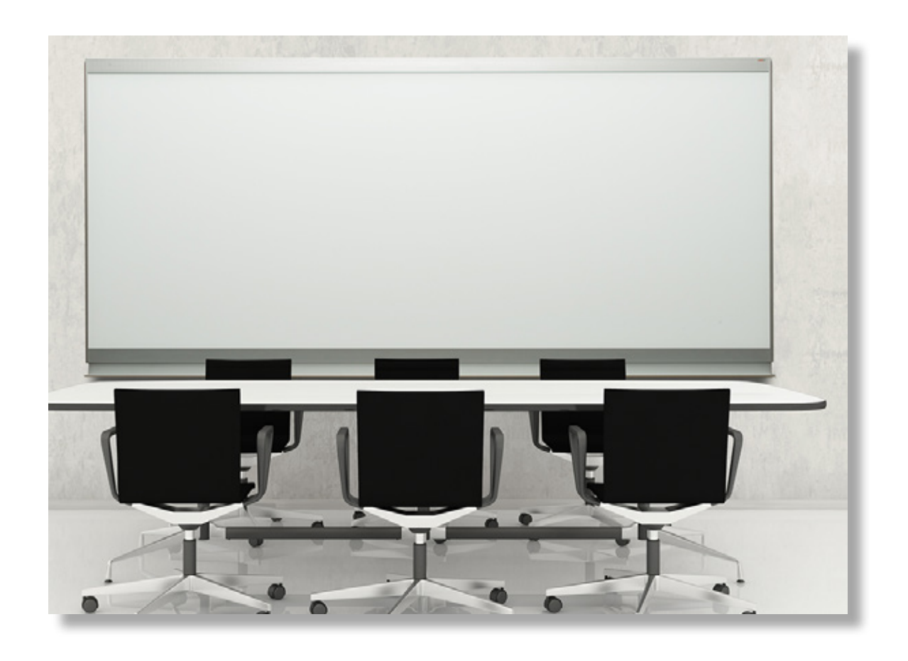
VIP Framed Glass Boards